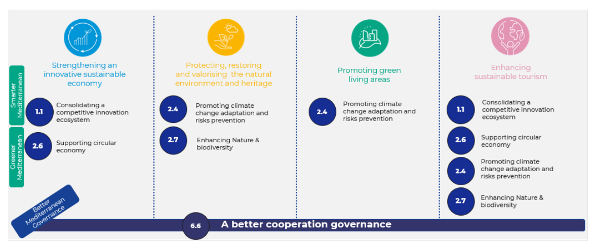
Illustration of the structure of the programmes and types of projects: Priorities, Specific Objectives and Missions.

To resume, each Thematic Strategic Territorial project shall contribute to one of the 4 missions and one of the specific objectives (aligned to one of the priorities) of the Programme: