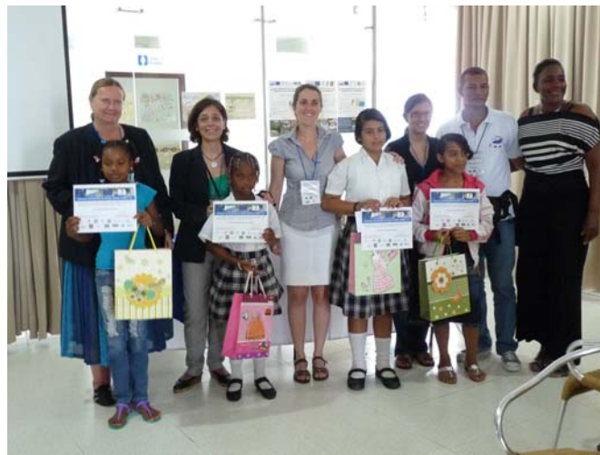
Winners in the awards ceremony