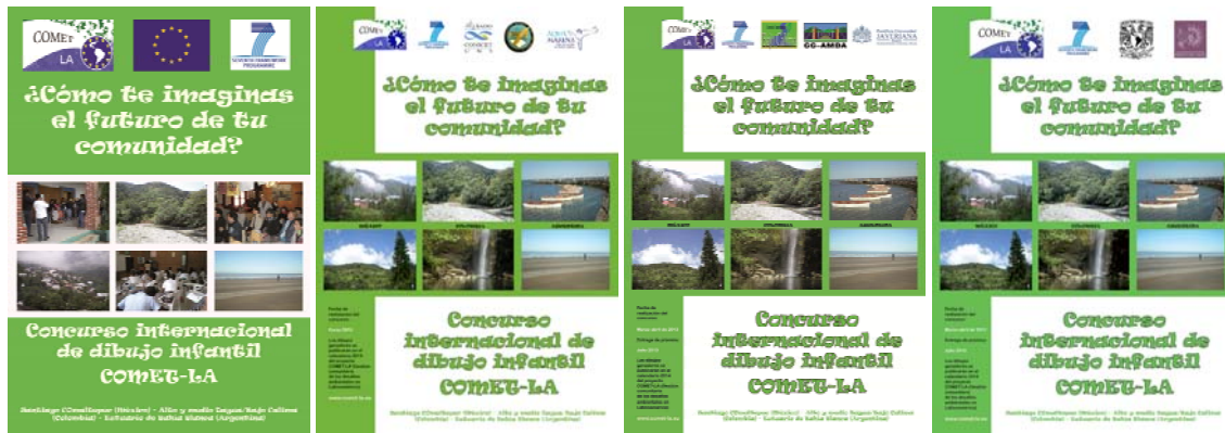
General and country posters

Some posters and bookmarks of the project were made to be distributed at the participating schools. At the front of them, - common to the three countries- it is explained the COMET project and at the back, there are the specifications of each case study.