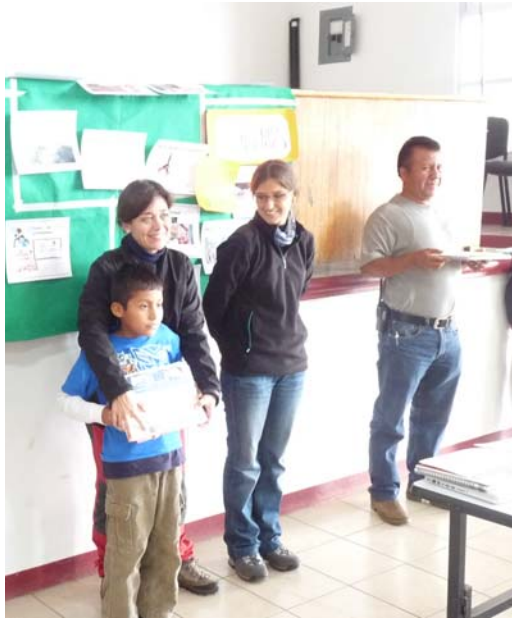
Drawing exposition and awards ceremony