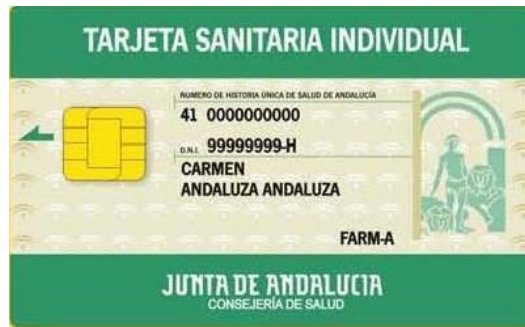
Figure 2. Individual Andalusian health insurance card