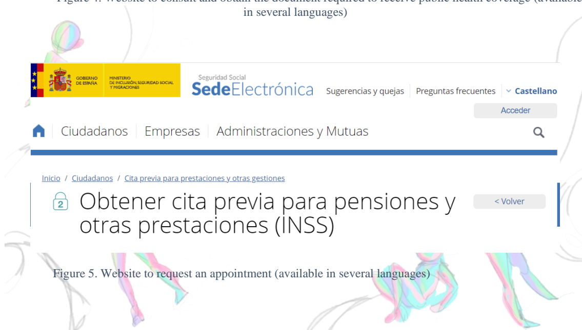
Figure 5. Website to request an appointment (available in several languages)